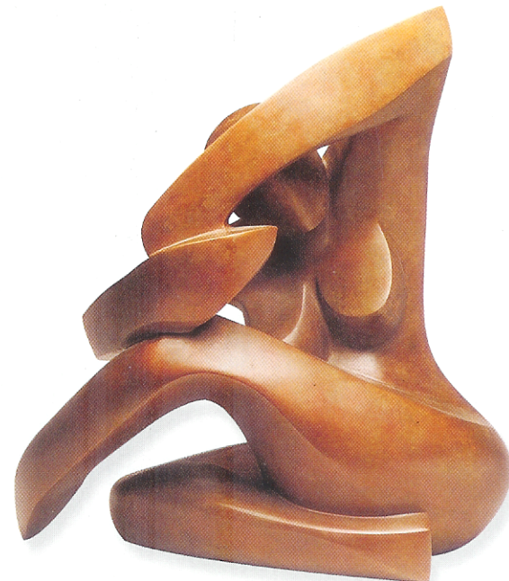
RECOIL, BRONZE, 25 X 20 X 14