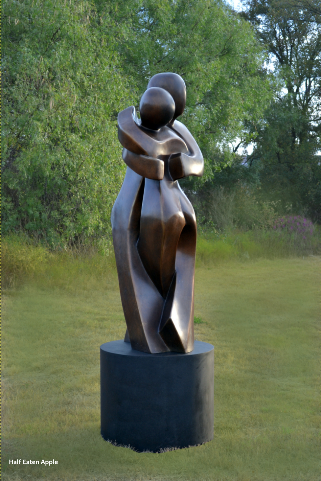
Half Eaten Apple